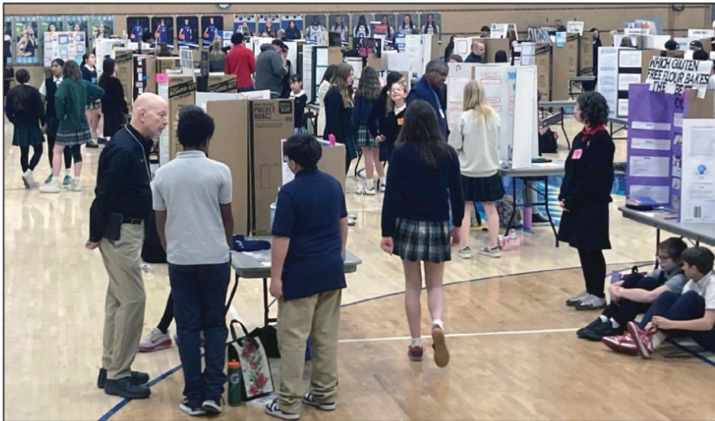
Students from across the diocese brought their best efforts to the Diocesan Science & Engineering Fair.