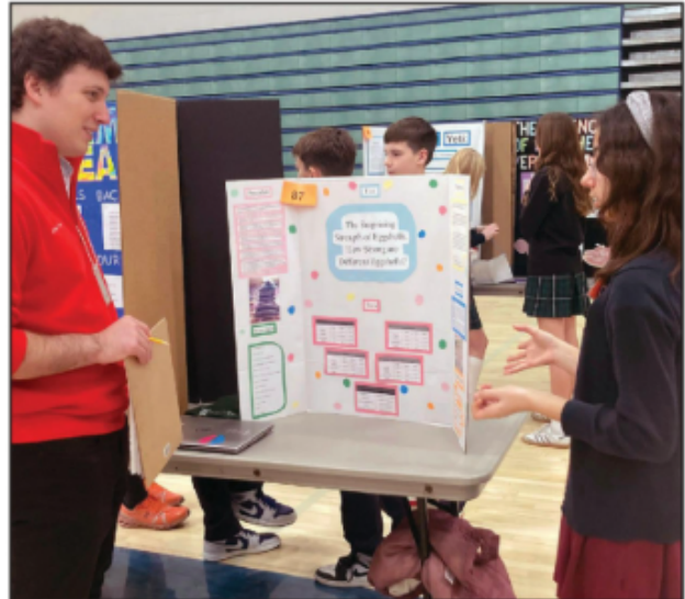
A student answers questions from a judge about her project at the Diocesan Science & Engineering Fair.