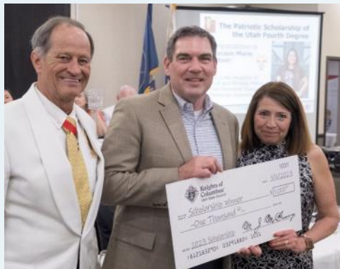
Patriotic Scholarship of the Utah Fourth Degree