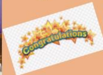
Article & Photos Submitted by Tom Cray