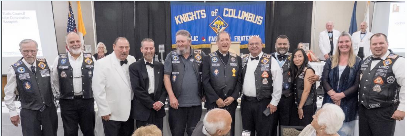
Knights on Bikes