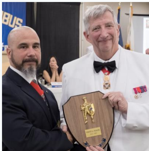
Council 16127, Hill Air Force Base