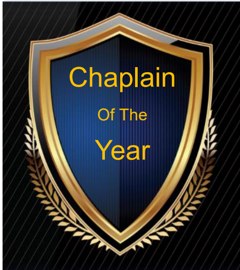
Council 10304, Taylorsville