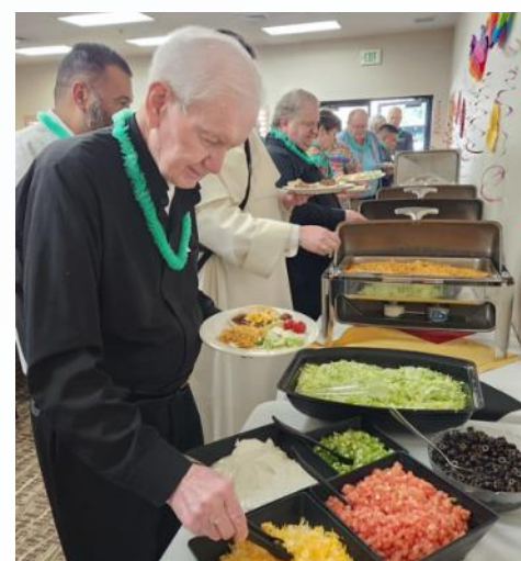
Cinco de Mayo Buffet