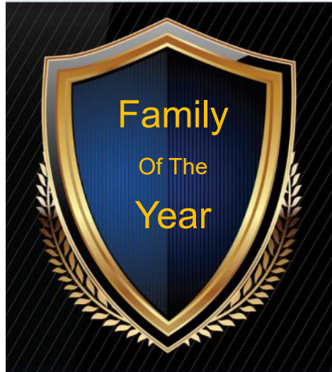
Council 6966, Sandy