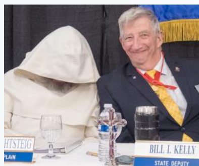
Father, can I borrow your robe?