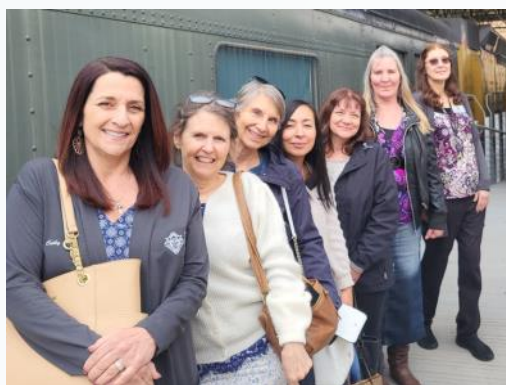
Ladies Program! Saint Mother Theresa Movie screening and tour of the Historic Ogden City Union Station Museum