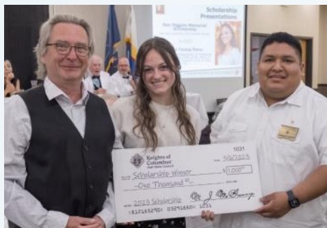
Dan Higgins Memorial Scholarship