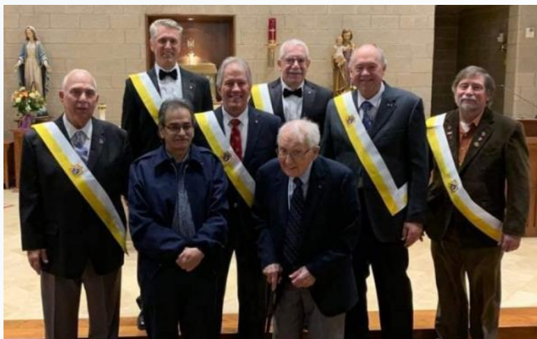
"Oldest member becomes newest member!"

PS – Once the councils schedule their ceremonials, their District Deputy should add them to the State Ceremonials Calendar (also displayed on the state website www.UtahKnights.org )