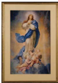
1981-82 Immaculate Conception