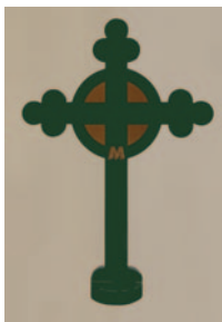
1999-2000 Millennium Cross