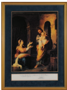
1993-94 Holy Family