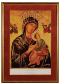
1984-85 Our Lady of Perpetual Help