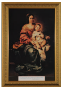
2002-03 Our Lady of the Rosary