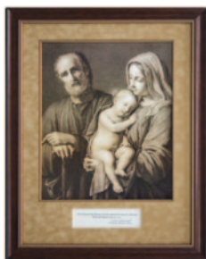
2015-17 Holy Family