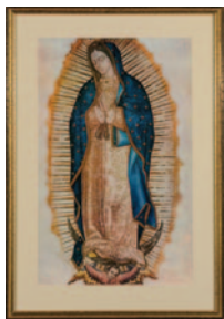
1979-80 Our Lady of Guadalupe