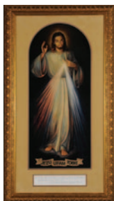
2003-04 Divine Mercy