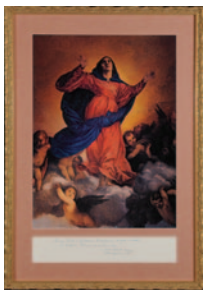
1990-91 Our Lady of the Assumption