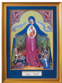
2018-20 Our Lady Help of Persecuted Christians