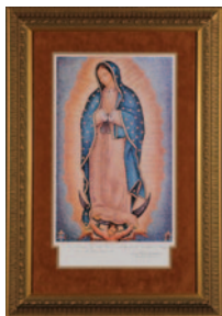
2000-01 Our Lady of Guadalupe