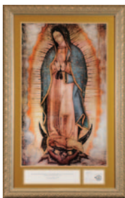
2011-13 Our Lady of Guadalupe