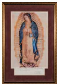
1995-96 Our Lady of Guadalupe