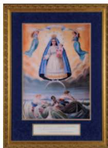
2007-08 Our Lady of Charity