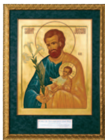
2021-23 St. Joseph