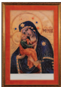
1988-89 Our Lady of Pochaiv