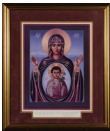
1997-98 Our Lady of the New Advent