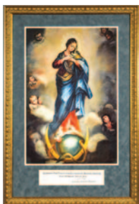
2013-14 Immaculate Conception