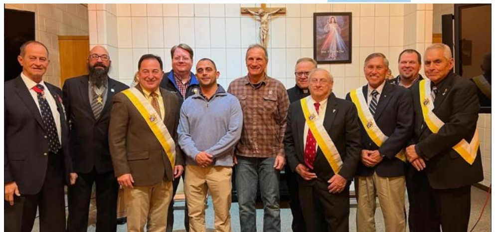
Two new Knights initiated into Council 5502 on 07-DEC-2022 at a live ceremonial, with the degree team, and some dignitaries.