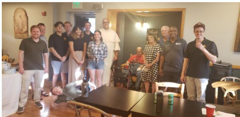
Gotta have at least 1 under the table!

2022 Pie and Beer Day, SLC Council 14764