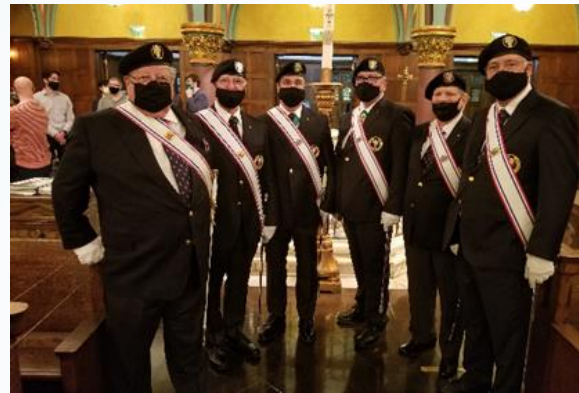
1/22—Mass for the Unborn