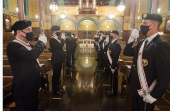
Salute with the Sword of Liberty