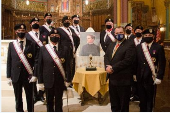
11/17 — Mass of Thanksgiving for the Beatification of Fr. Michael J. McGivney

Not yet a Sir Knight? See page 7 for information on upcoming exemplifications to join the fourth degree. Fourth degree members can purchase the new uniform online at www.kofcuniform.com/home