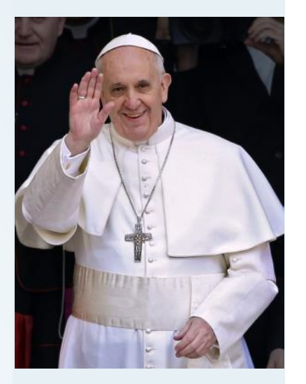
THE MONTH OF DECEMBER IS DEDICATED TO THE IMMACULATE CONCEPTION.

The first 24 days of December fall during the liturgical season known as of Advent and are represented by the liturgical color purple — a symbol of penance, mortification and the sorrow of a contrite heart. The remaining days of December mark the beginning of the Christmas season. The liturgical color changes to white or gold — a symbol of joy, purity and innocence.