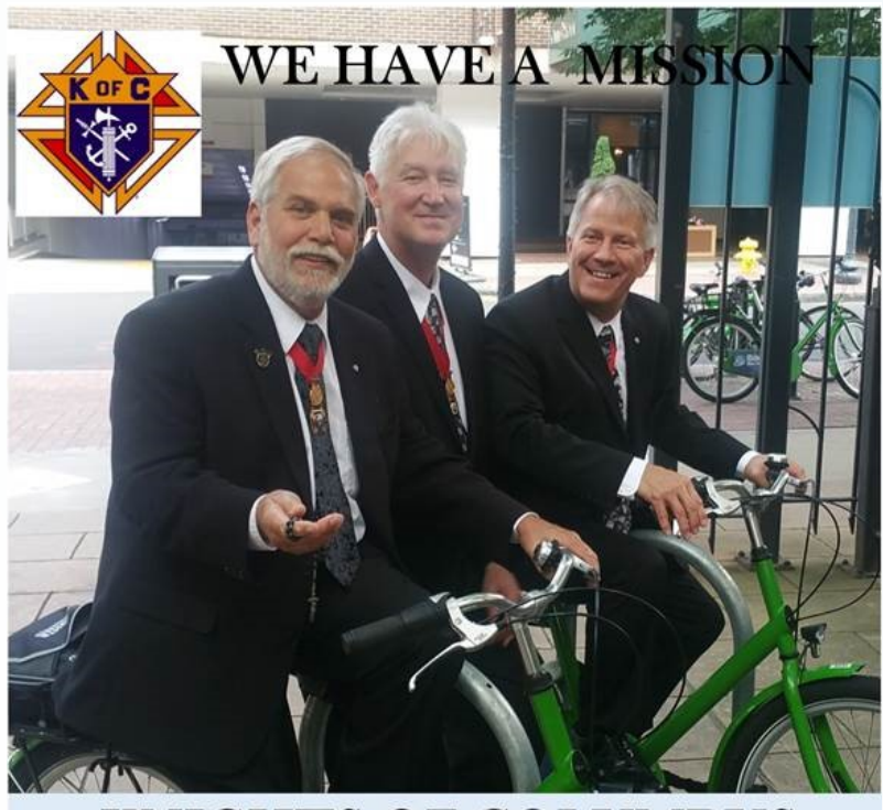
KNIGHTS OF COLUMBUS

See all the upcoming activities and events going on in the state. http://utahknights.org/