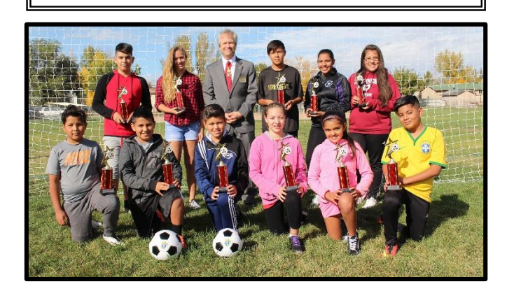
2016 Soccer Challenge 1st place winners

Here is the link to the Catholic Diocese of Salt Lake City: <a href="https://www.dioslc.org/safe-environment">https://www.dioslc.org/safe-environment</a>.